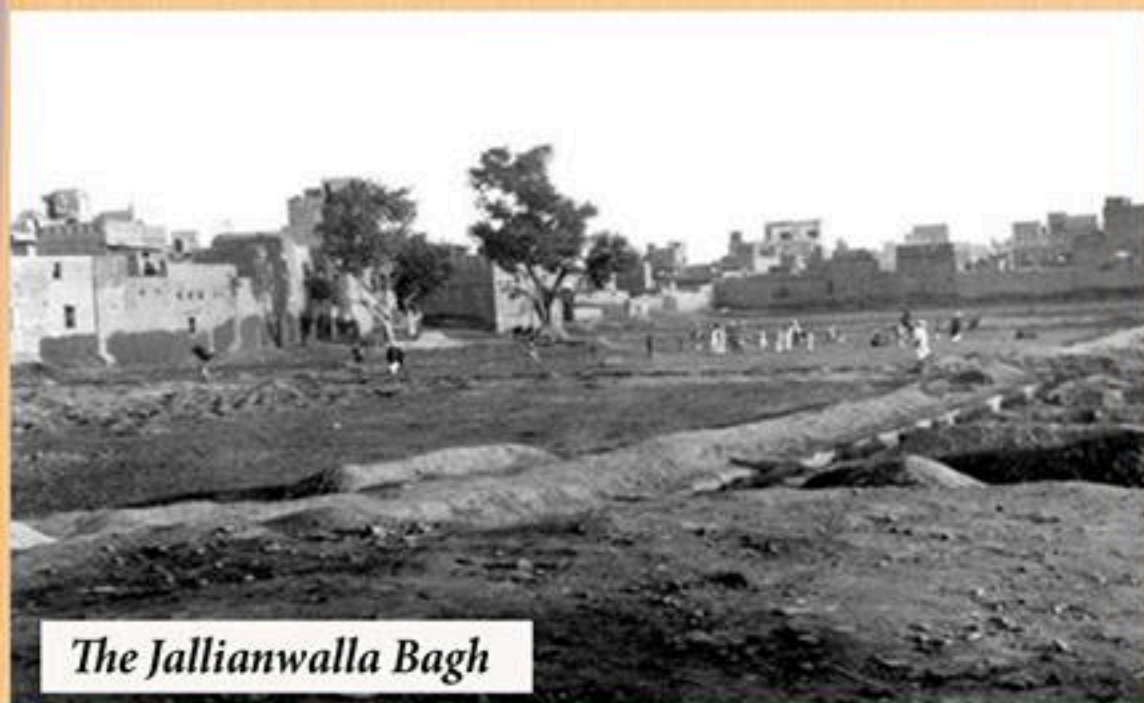
The Jallianwalla Bagh