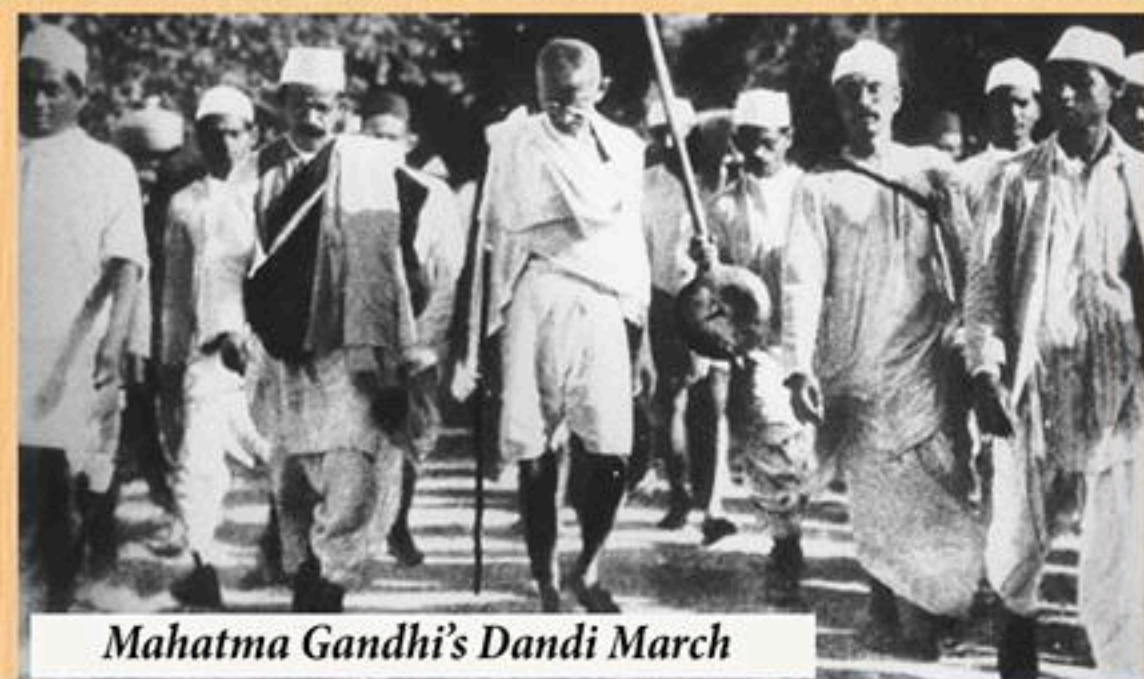
Mahatma Gandhi's Dandi March